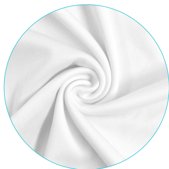
A | Single jersey polyester