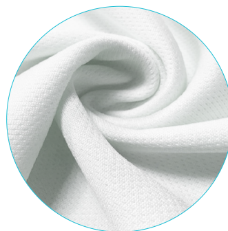
C | Coolmax® micro bird eye